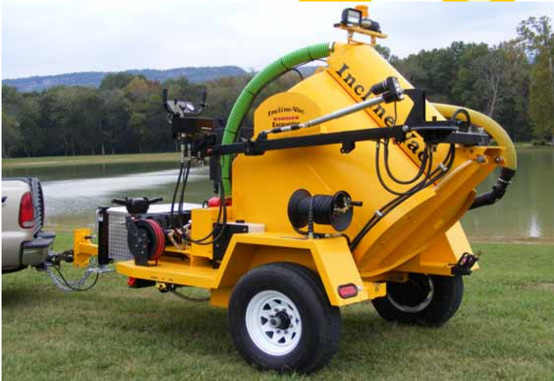
Model 250 Incline-Vac